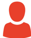
Franziska Brantner Parliamentary State Secretary at the Federal Ministry for Economic Affairs and Climate Action

"Germany is dependent on China - and it will stay that way for now." We need "staying power ... Processes such as raw material extraction, further processing and recycling cannot be relocated overnight. It's about licenses, energy requirements [etc.] ... Looking at the necessary investments, we are talking about years, if not decades [to diversify]."